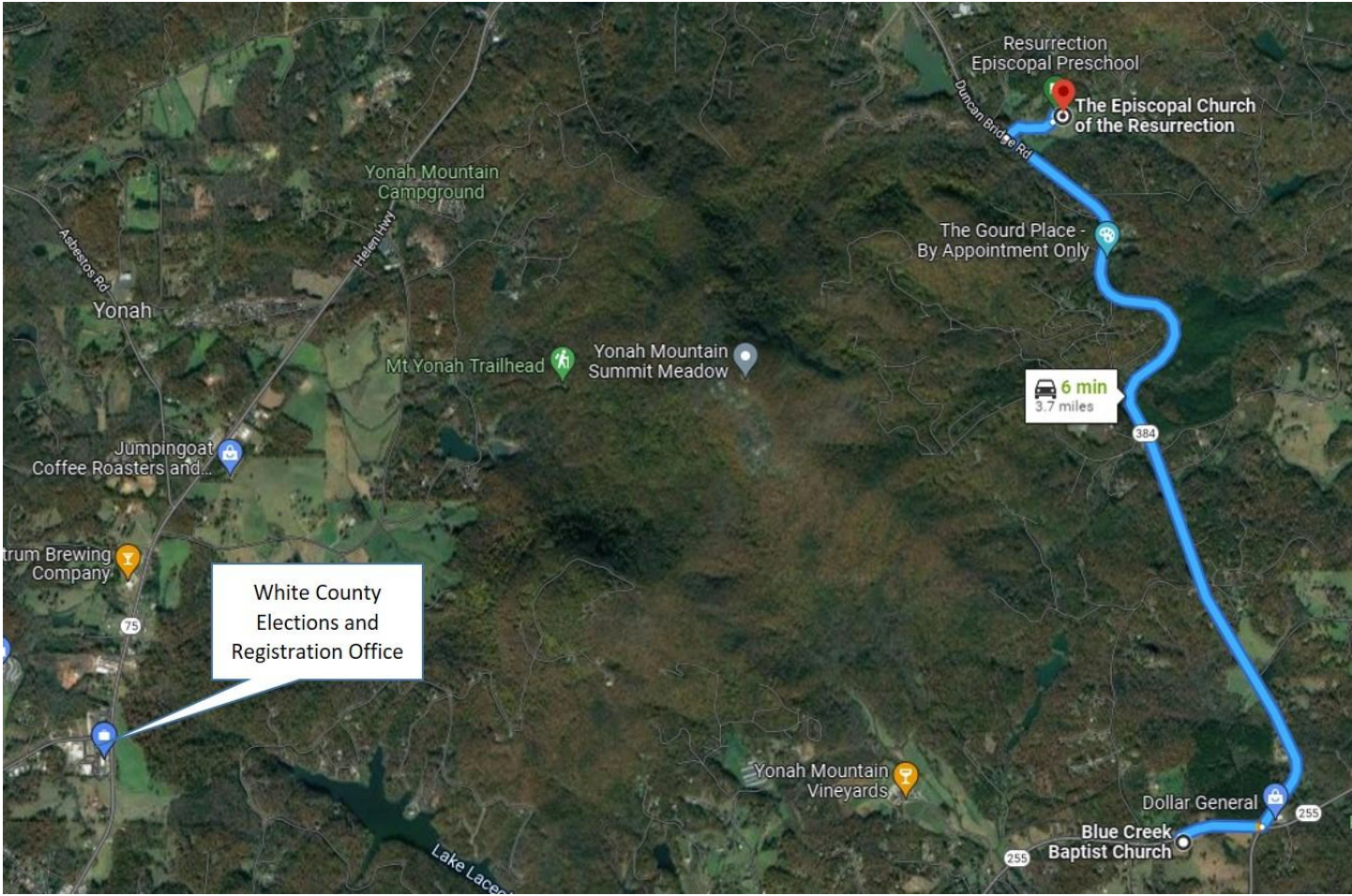
[Map location of the planned location change of the Blue Creek Polling Location]